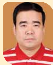
Zhongsheng Lu China