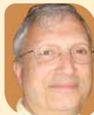
Samuel Adler Israel